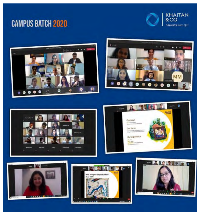
Campus Batch 2020: Virtual Onboarding

the engagement high. Other tangible benefits that we witnessed were with respect to their preparedness before they joined the Firm. It also helped them get to know each other and their peers at a deeper level despite being caught in the virtual world.