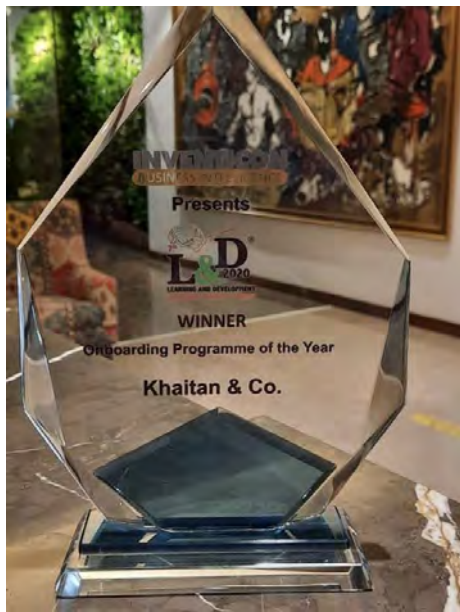
Recipient of the Onboarding Programme of the Year Award

As a recognition towards our continued efforts in the L&D space, the Firm was chosen as the 'Winner' under the 'Best Onboarding Category' by Inventicon's Learning & Development Leadership Award 2020. This Award only reaffirms that we are in the right direction and are committed to continue doing extraordinary work and set new benchmarks in the L&D domain.