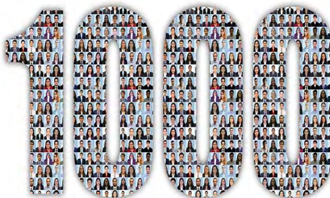
Celebrating 1000 Members!

It is said that a journey of a thousand miles begins with a single step, and the Firm has indeed proved this adage to be true, by achieving a significant milestone of building a 1000-member strong family. While the Firm became more fortified in 2020, we hope that the current year marks the advent of the Firm’s march towards greater heights!